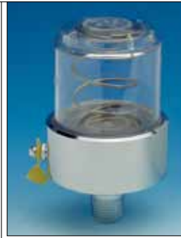
Series 500 Corrosion resistant