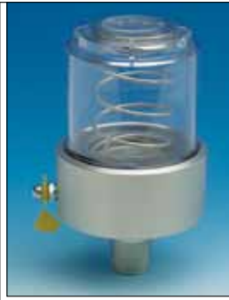
Series 300 Metal base