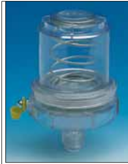
Series 200 Polycarbonate base

Spring selection to be determined by operating temperature and NLGI grade. See table below