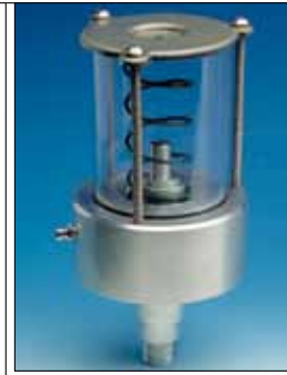
Series 700 High temperatures

Standard model for general applications with minimal vibration, impact, shock, high-torque or centrifugal forces. Pressure spring made of stainless steel.